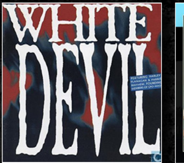
1995 .: WITH WHITE DEVIL REINCARNATION