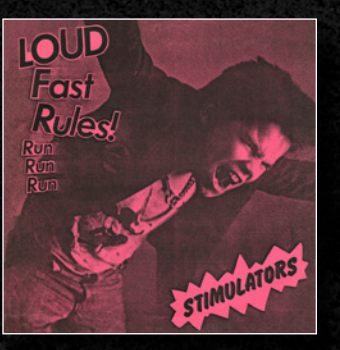
2018 :: WITH THE STIMULATORS LOUD FAST RULES! RE-RELEASE