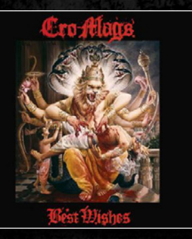
1989 :: WITH CRO-MAGS BEST WISHES