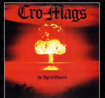
1986 :: WITH CRO-MAGS THE AGE OF QUARREL