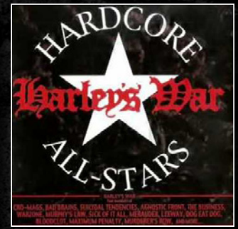
2008 :: WITH HARLEY'S WAR ALL-STARS