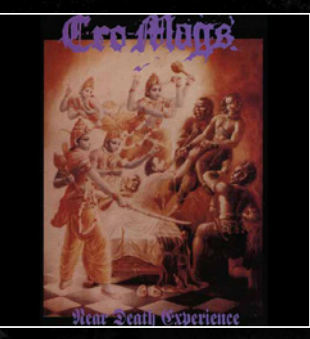
1993 :: WITH CRO-MAGS NEAR DEATH EXPERIENCE