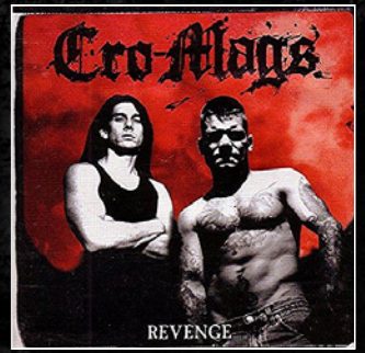
2000 :: WITH CRO-MAGS REVENGE

2000 :: WITH CRO-MAGS BEFORE THE QUARREL