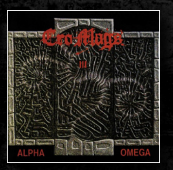
1992 :: WITH CRO-MAGS ALPHA OMEGA