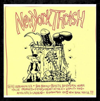
1982 :: NEW YORK THRASH VARIOUS ARTISTS COMPILATION