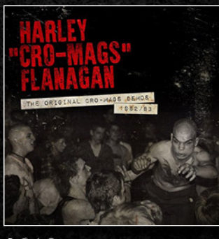
2018:: HARLEY "CRO-MAGS" FLANAGAN 1982/83 CRO-MAGS DEMOS